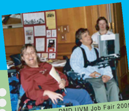
DMD UVM Job Fair 2005

"DMD was an excellent way to learn about a particular job and the needed skills to be successful. I was delighted to job-shadow at a bank, since I plan to work in banking when I complete my training."