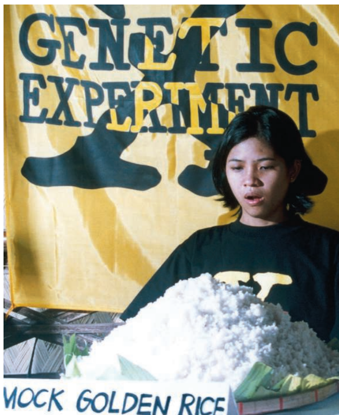
Eat your dinner. Greenpeace said more than 3 kilos of golden rice daily were needed to meet dietary standards for vitamin A.